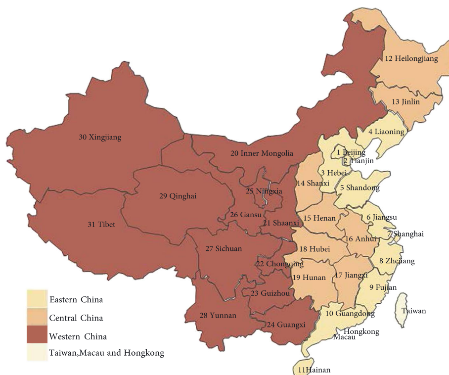
Fig. 1 Geographical divisions in China. Legend: Eastern China (including: 1 Beijing, 2 Tianjin, 3 Hebei, 4 Liaoning, 5 Shandong, 6 Jiangsu, 7 Shanghai, 8 Zhejiang, 9 Fujian, 10 Guangdong, and 11 Hainan). Central China (including: 12 Heilongjiang, 13 Jilin, 14 Shanxi, 15 Henan, 16 Anhui, 17 Jiangxi, 18 Hubei, and 19 Hunan). Western China (including: 20 Inner Mongolia, 21 Shanxi, 22 Chongqing, 23 Guizhou, 24 Guangxi, 25 Ningxia, 26 Gansu, 27 Sichuan, 28 Yunnan, 29 Qinghai, 30 Xinjiang, and 31 Tibet). Taiwan, Macau and Hongkong

out-of-pocket payments clearly, because it was a large family expense and because the reimbursement procedures were complex, with patients and their family paying medical expenses before seeking reimbursement from their medical insurance. All costs were adjusted to 2016 prices and based on a currency exchange rate of the 6.6423 yuan to US$1 in 2016.